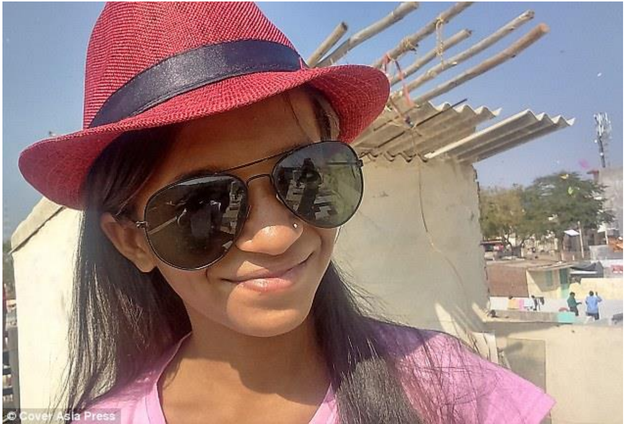
Creepy crawlies: Her problem started in August last year, and so far, doctors have removed more than 1,000 ants from her ears