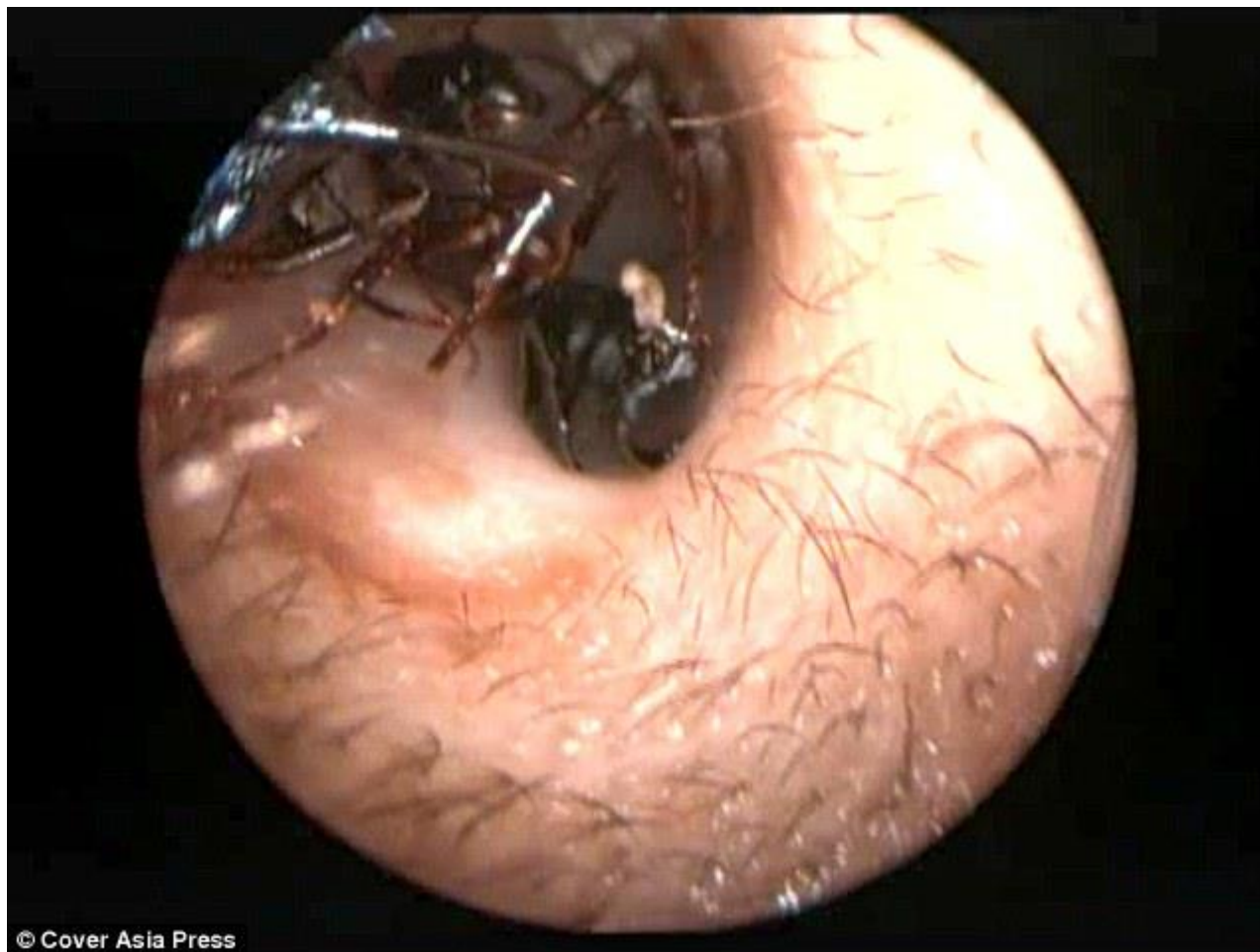
Gross: A video filmed with an endoscopic camera shows a doctor removing what appears to be dead ants from the 12-year-old's ear

'She doesn't experience any kind of pain - despite the ants biting her - and no damage has been found to the eardrums.